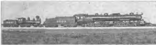
SANTA FE LOCOMOTIVES, 1869 AND 1911.

to that place from Topeka to celebrate the event. Cyrus K. Holliday, the projector of the enterprise and first president of the company, in a speech on that excursion, predicted that one day the western terminus of the road would be at some point on the Pacific coast. It is said that when the prophecy was uttered, one incredulous individual, unable to control his mirth at the thought of that little crooked road becoming a